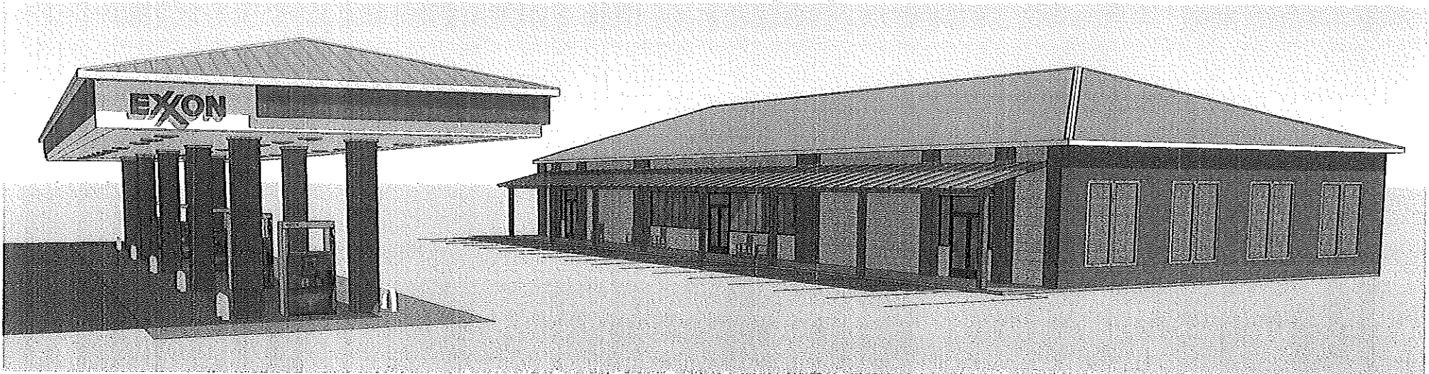
Canopy, 144'x30', 36" tall fascia, 4:12 hipped standing seam roof, brick columns to match building. Four (4) recessed wooden shutters on building's east end. Shutters 8'-8"H x 7'-4"W.